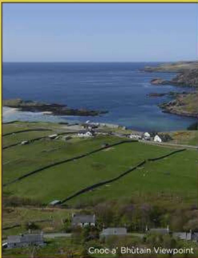
Cnoc a' Bhùtain Viewpoint