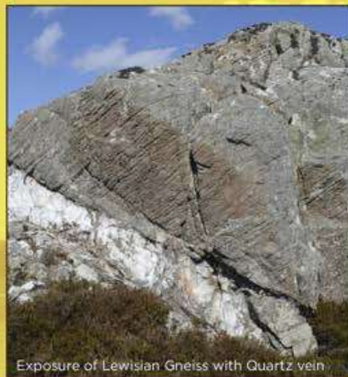
Exposure of Lewisian Gneiss with Quartz vein

The Scourie area is world-famous for its very special rocks and geological heritage and is regularly visited by geology students, teachers and researchers from other countries. When you are here, you are in the "Cradle of Geology" and the essential rock-features can be easily seen from the paths. Much of the area you are walking over has been designated as a Site of Special Scientific Interest (SSSI).