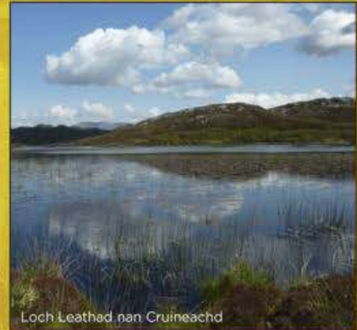
Loch Leathad nan Cruineachd

Print and design by Strath Print, Isle of Skye | tel: 01471 802 555 | www.strathprint.co.uk